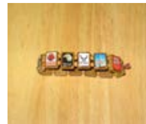
Veteran Wrist Story Bracelets