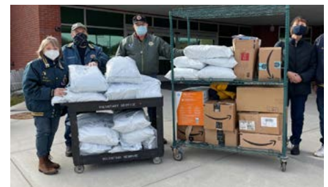
Underwear at the VA Hospital.