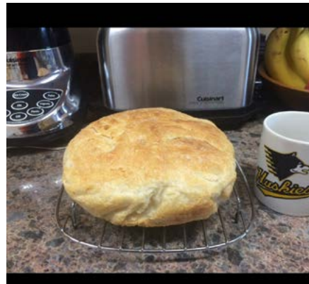
Homemade bread: Yes, for Covid-19 shutdown