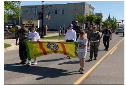
May 30, 2022: Chapter 310, Parade after restrictions.