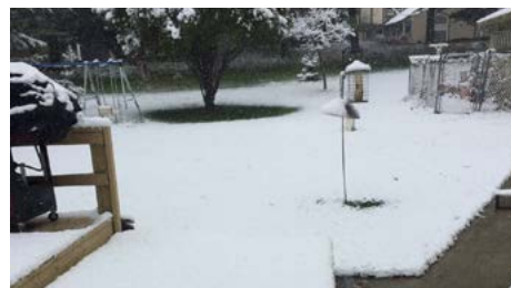
March 22, 2020 -- Snowfall and implications for Pandemic